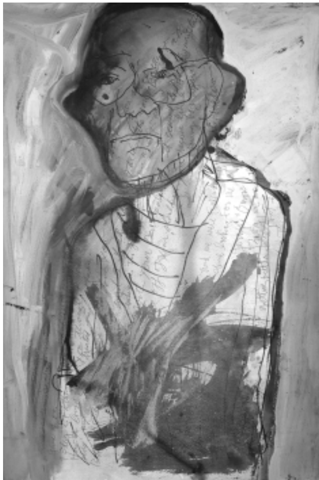
BS 778, Barry Simons, Untitled, 2002, mixed media on paper, 22 x 15"