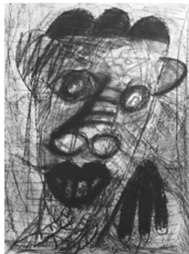
BS 774, Barry Simons, Untitled , 2002, mixed media on paper, 24 x 18"

The film, A Few Good Years , deals with three generations of a prosperous NY family, the Grombergs, who are portrayed by 3 generations of a prominent Hollywood family, the Douglases. The eldest Gromberg is struggling with the specter of his impending death, the youngest has a debilitating drug problem, while the middle Gromberg struggles to hold the cantankerous clan together. The