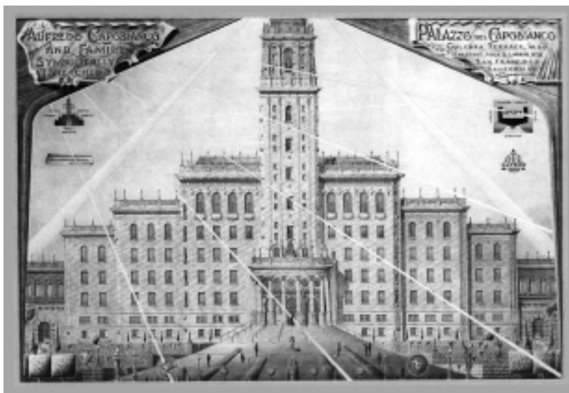
A.G. Rizzoli, S10, Alfred Capobianco and Family Symbolically Sketched / Palazzo del Capobianco , 1937, ink on rag paper, 24 1/16 x 38 5/16"