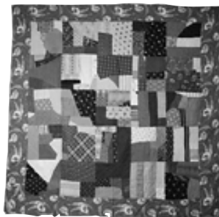
50/8302, Crazy Quilt, nd, cotton, 76 x 78"