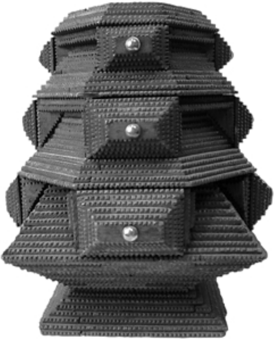
70B/08W02, Tramp Art Twelve Drawer Box, nd, cigar box and other materials, 11.25 x 7"