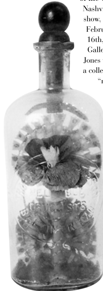
22 BF/0202, bottle whimsy w/ fans, nd, mixed media, 9" tall