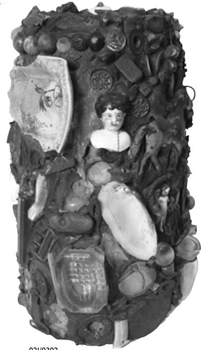
02j/0302, memory jug, nd, mixed media, 10.5" tall,